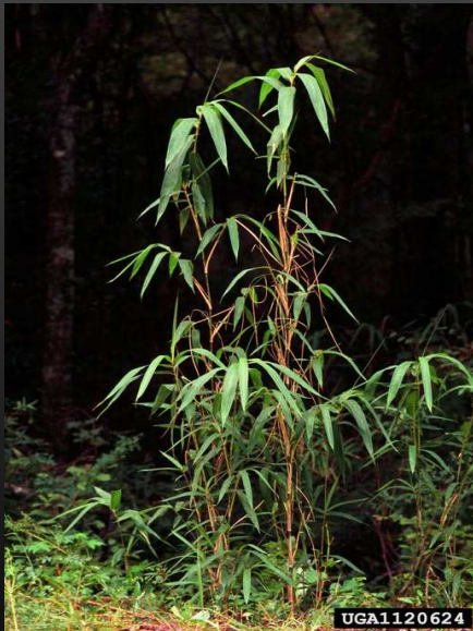
Chahta anumpa: Uski Latin name: Arundinaria gigantea Common name: River Cane