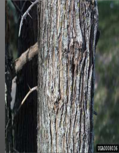
Chahta anumpa: Kvti lakna Latin name: Maclura pomifera Common name: Bois d'arc