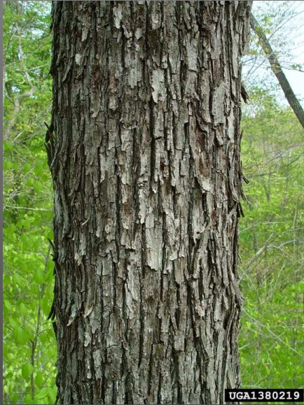
Chahta anumpa: Uksak vpi Latin name: Carya sp. Common name: Hickory