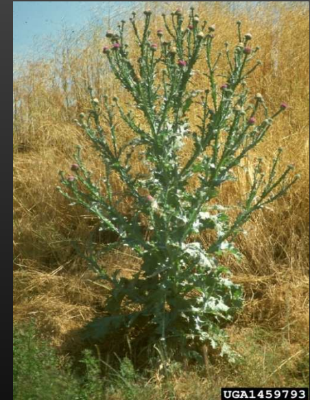
Chahta anumpa: Shumatti Latin name: Onopordum acanthium Common name: Cotton Thistle